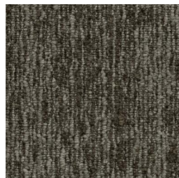
22210 wolf LRV: Y 7.41