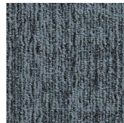
22208 lake LRV: Y 7.10