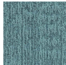
22219 rapids LRV: Y 15.77