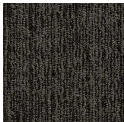
22205 moose LRV: Y 3.24