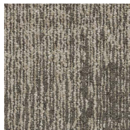
22209 husky LRV: Y 14.79