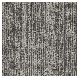
22201 ice LRV: Y 14.80