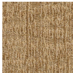
22215 maple LRV: Y 24.28