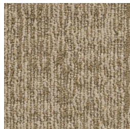
22213 antler LRV: Y 23.07