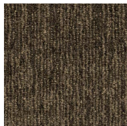
22214 cabin LRV: Y 6.05