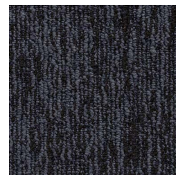
22207 creek LRV: Y 2.73