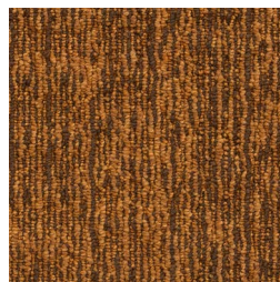
22216 amber LRV: Y 7.71