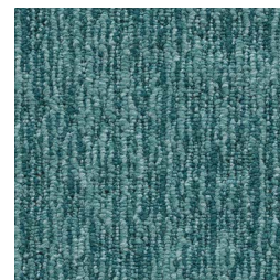
22220 lagoon LRV: Y 8.30