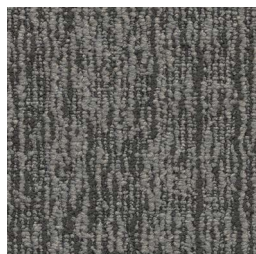
22202 ridge LRV: Y 10.09