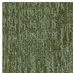
22218 alpine LRV: Y 15.16